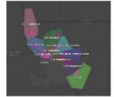
our work sites w/ ADB

This project required working around the customer's schedule to include Overnight Labor